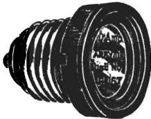
List No: F.160 etc., \frac{1}{4} " 31.8 mm Rim- \varnothing . E.27 \frac{1}{2} Cap.