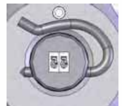
Rod Style A