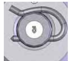
Rod Style B