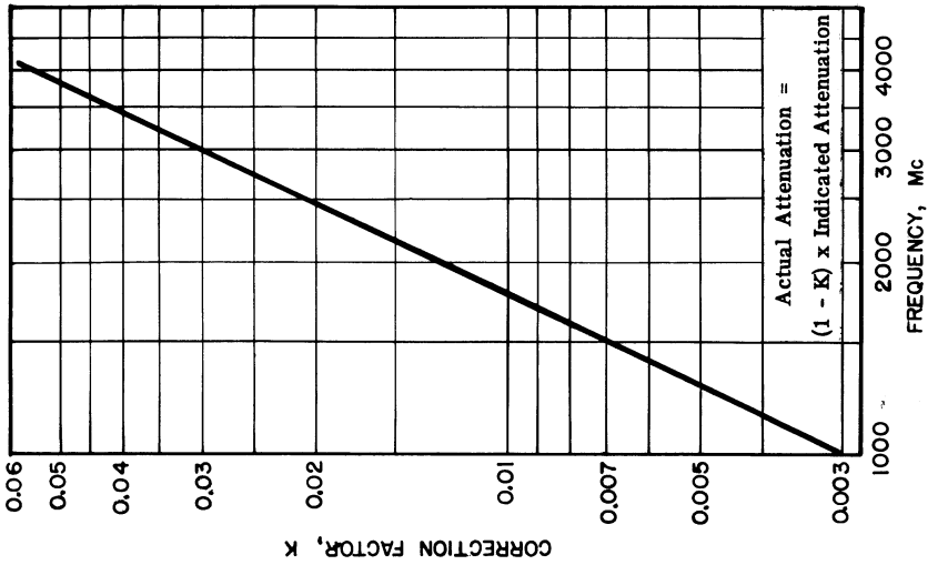
Figure 3. Frequency Correction Factor.