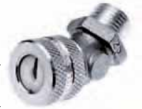
Machined Aluminum †

Δ Nuts are machined zinc-plated steel and bodies are malleable iron, cadmium plated.