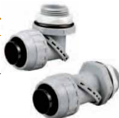
PS0509NGY – SwivelLok®

¾" Liquidtight conduit fitting have ½ N.P.T. male threads.