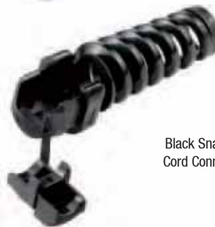
Black Snap-In Cord Connector