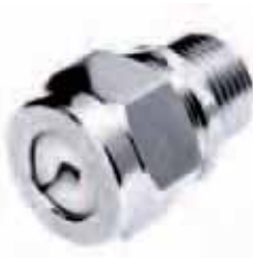
Machined Zinc-Plated Steel