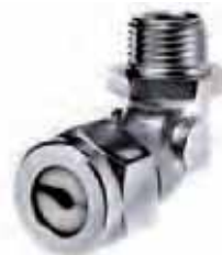
Machined Zinc-Plated SteelΔ