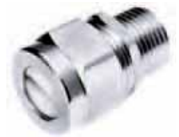
Machined Zinc-Plated Steel