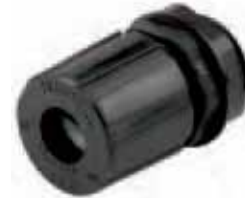
Black Cord Connector