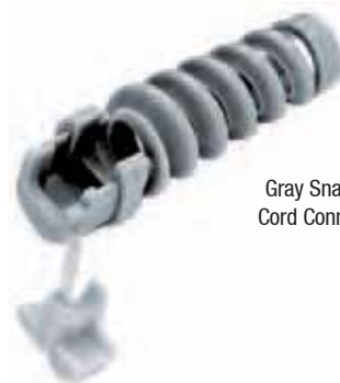
Gray Snap-In Cord Connector