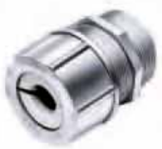
Cast Aluminum Malleable Iron