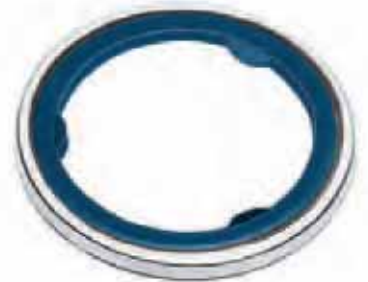
Metal Clad Sealing O-Rings