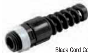
Black Cord Connector with Spiral