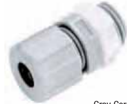
Gray Cord Connector