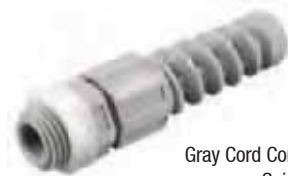
Gray Cord Connector with Spiral