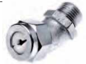
Machined Zinc-Plated Steel Δ